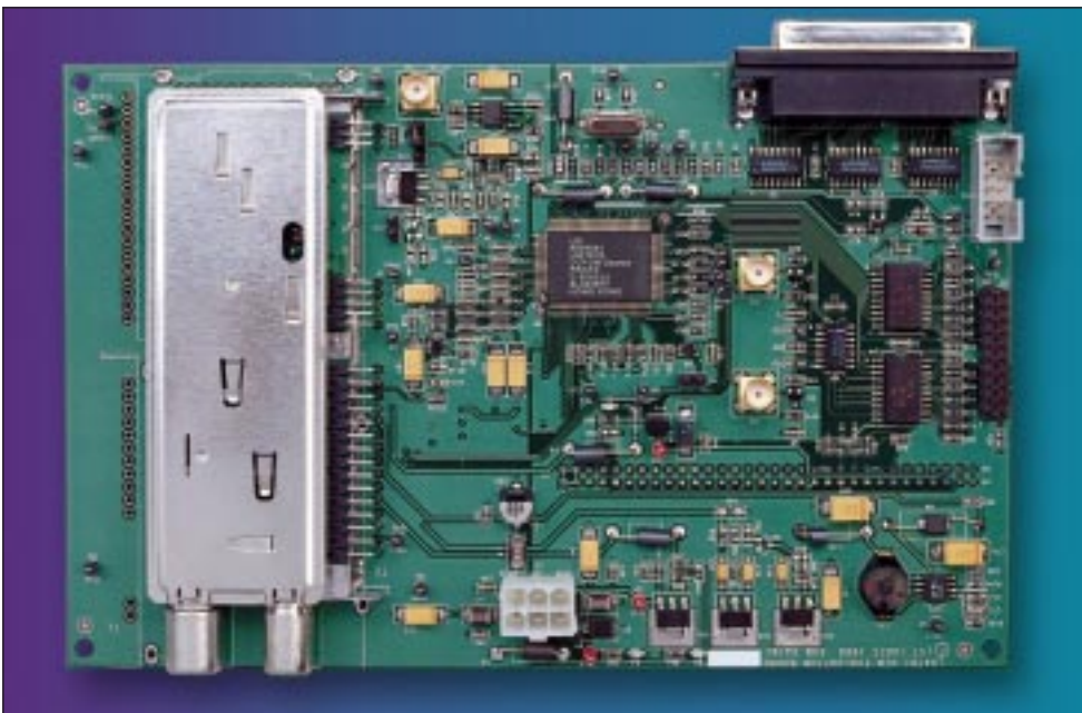
NIM781 Evaluation Board provides full capabilities for accelerated development and fast time to market

To accelerate development of set-top box solutions, the L64781 is available with a developer's kit, allowing manufacturers to select the option best suited to their target market and application requirements. The kit provides the hardware and software components to shorten development cycles and to ensure a fast time to market. The powerful Windows 95 Graphical User Interface allows manufacturers to easily perform validation tests and store results in an intuitive way.