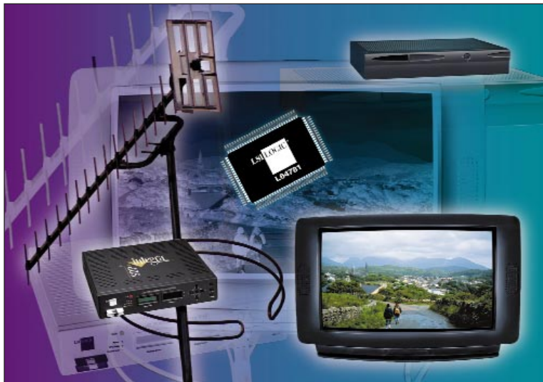
The L64781, LSI Logic's fully integrated single-chip COFDM demodulator, is fully compliant to the DVB-T standard for digital terrestrial television in Europe

The L64781 is a fully variable rate demodulator, supporting 6, 7 and 8MHz channels. The chip is highly integrated (both timing and frequency loops are fully digital) and capable of delivering up to 31.7 Mbit/sec. This represents more than 20 movie channels or 4 live video channels in each 8MHz channel previously filled by a single analog PAL channel.